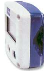
Option HA: Aluminium casing IP 67