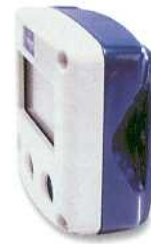
Option HA: Aluminium casing IP 67