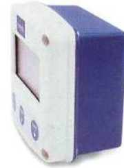
Option HD: ABS wall-mount casing IP 65