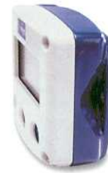
Option HA: Aluminium casing IP 67