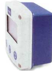
Option HD: ABS wall-mount casing IP 65