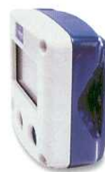
Option HA: Aluminium casing IP 67