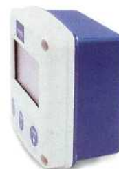
Option HD: ABS wall-mount casing IP 65